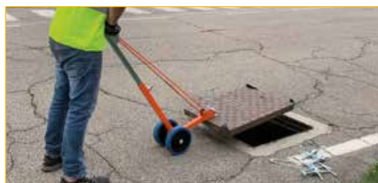
Use 3: combination APS80 with mechanical clamp and hooks set