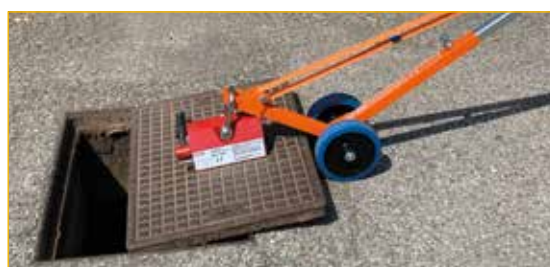
Use 2: combination APS80 and Permanent magnet PM400 or PM500.