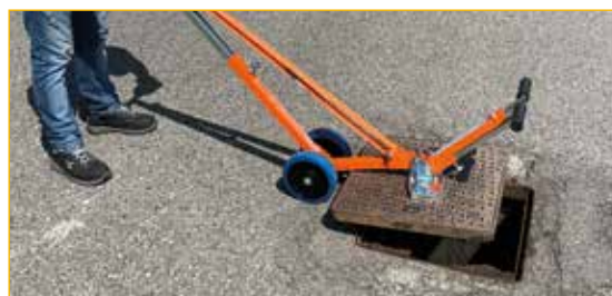
Use 1: opening with magnetic CL10 - CL11.