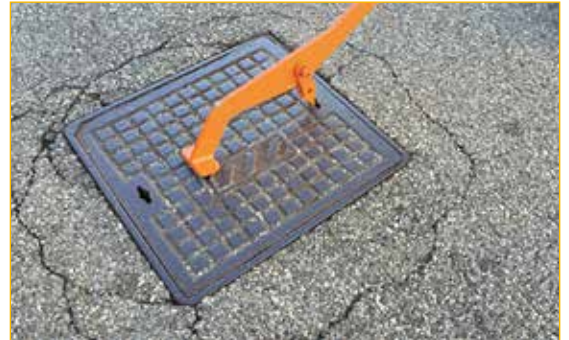
Inserting the hook into the slot and rotate to 90°.