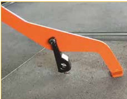
Possibility to custom hooks according to specifications if needed.