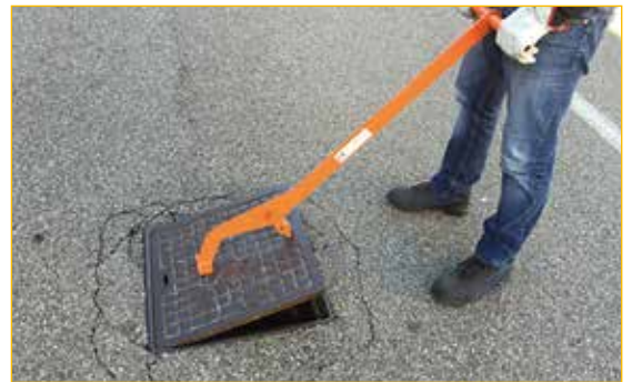
In the opening operation, the length of the lever limits the operator effort.