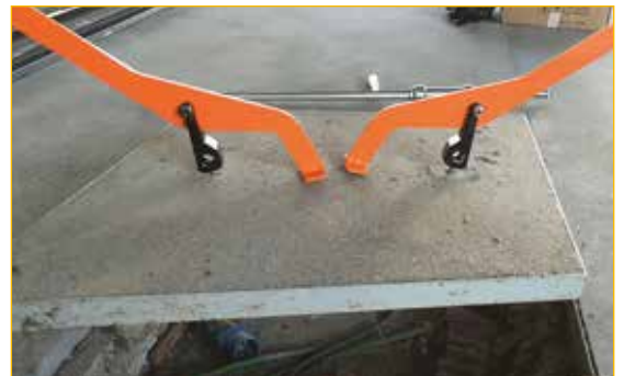
Opening larger lid can be done with two LB2.