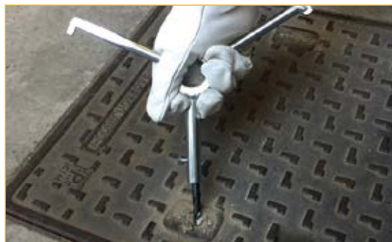
Configuration 1: with flat drill bit hook to clean and scrape.