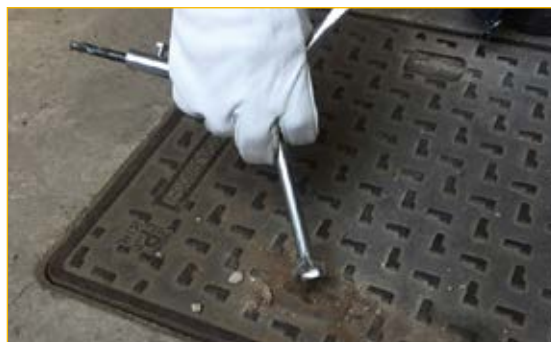
Configuration 3: "T" shaped end to be used as a flap or insertion key in the slots.