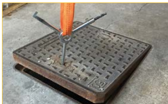
Configuration 4: use in synergy with a choke belt for lifting operations