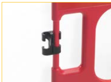
Snap closure clip.