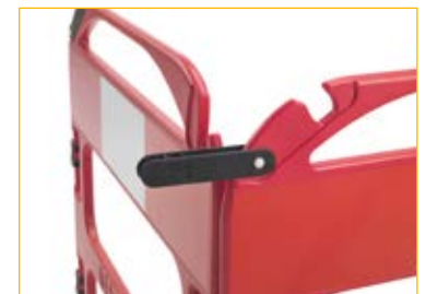
Locking and joining pin on sides.