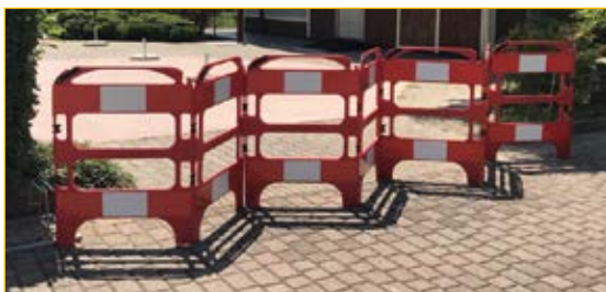
Use as an unfolded linear barrier.