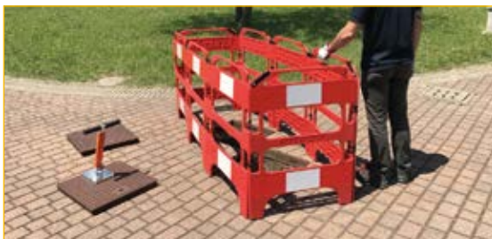
The absence of sharp edges avoids accident.