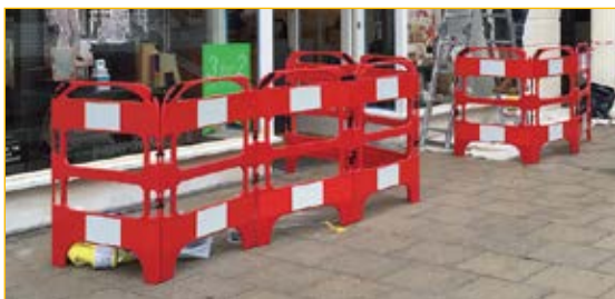
Adhering to the road code contemplated in the DPR 12/16/1992 n.495 and subsequent modifications.