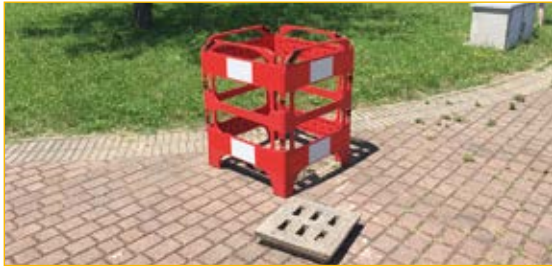
Very practical, it starts and folds up in seconds.

Practical, very compact and light security gate ideal for signaling and securing open manhole area during maintenance work on underground networks and services.